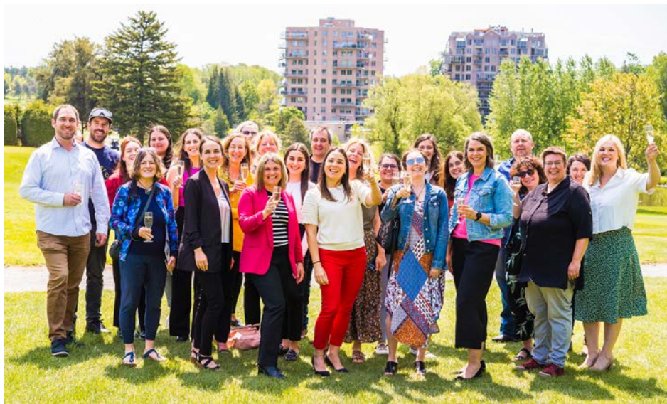
Tourism industry partners kick off the summer season in the Eastern Townships